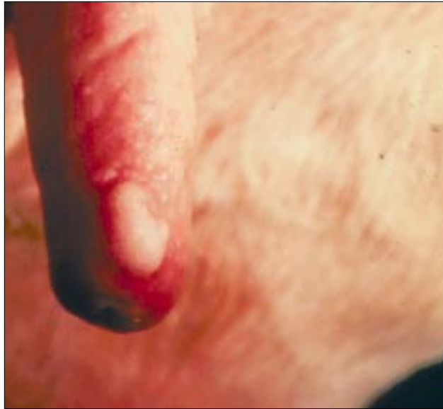
Unruptured teat lesion on a cow.