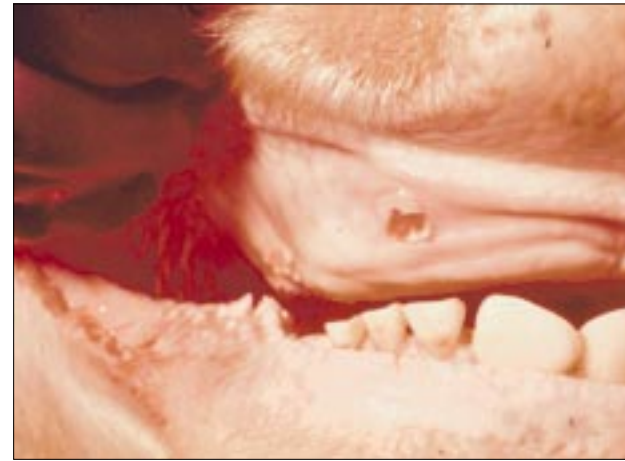
Recently ruptured vesicle (blister) above the dental pad.

FMD rarely kills animals; however, meat animals do not normally regain lost flesh for many months. Recovered cows seldom produce milk at their former rates. Death from FMD occurs most often in newborn animals and with variable frequency in older animals.