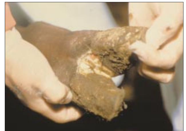
A ruptured vesicle with blanching of tissue in the interdigital space.