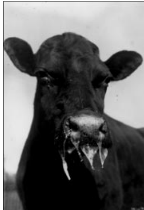
Excessive salivation and smacking of the lips are early signs of FMD.

Because it spreads widely and rapidly and because it has grave economic as well as physical consequences, FMD is one of the animal diseases that livestock owners dread most.