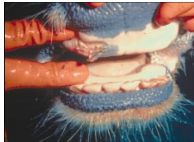
Ruptured vesicle on the dental pad.