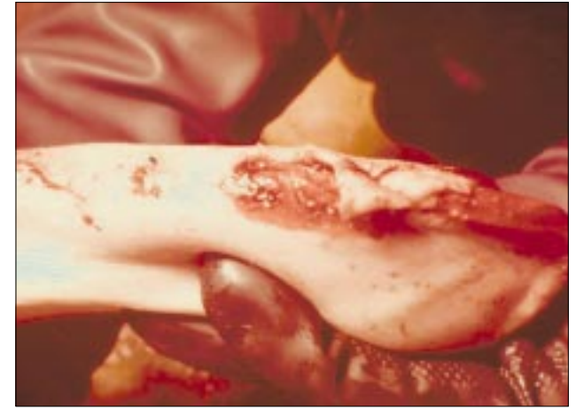
Tongue vesicles that have ruptured and begun to slough.