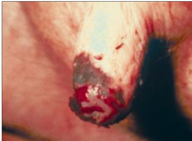
Ruptured teat lesion with necrosis.